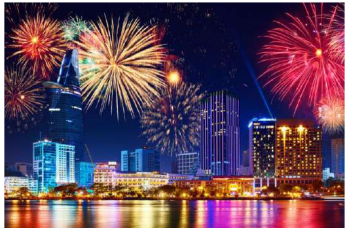
Firework on New Year Eve in Dist. 1