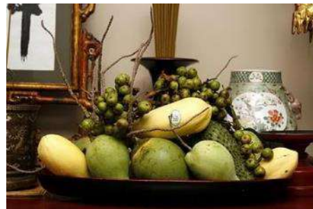
Fruit offering in the South include custard apples, coconuts, papayas, mango and goolar fig. In Vietnamese they are “Cầu, Dừa, Đủ, Xoài, Sung” which in the South literally is a prayer to “have enough to use” in the New Year.