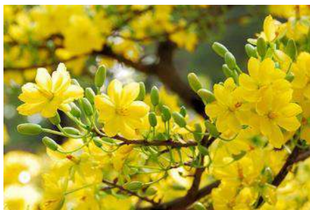
Hoa Mai (Ochna Intergerrima)

Hoa Đào (peach blossom) is more common in the North as it can grow in the dry and cold weather. It is used to ward off evil spirits during the Tết celebrations.