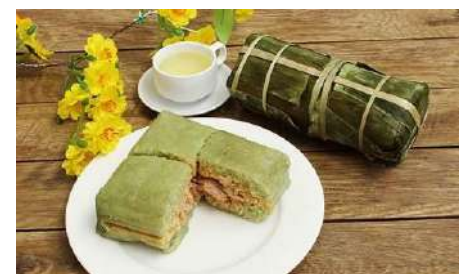
Bánh Chưng and Bánh Tét

Thịt Kho Tàu : "Meat Stewed in Coconut Juice", a traditional dish of pork belly and medium boiled eggs stewed overnight in a broth-like sauce, often eaten with pickled bean sprouts and chives and white rice.