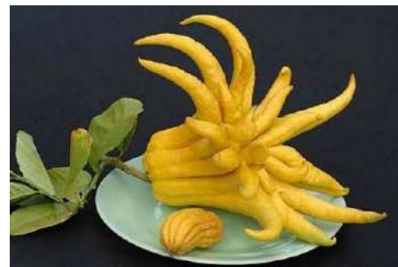
Quả Phật Thủ, (Buddah's Hand) fruit, considered good luck.