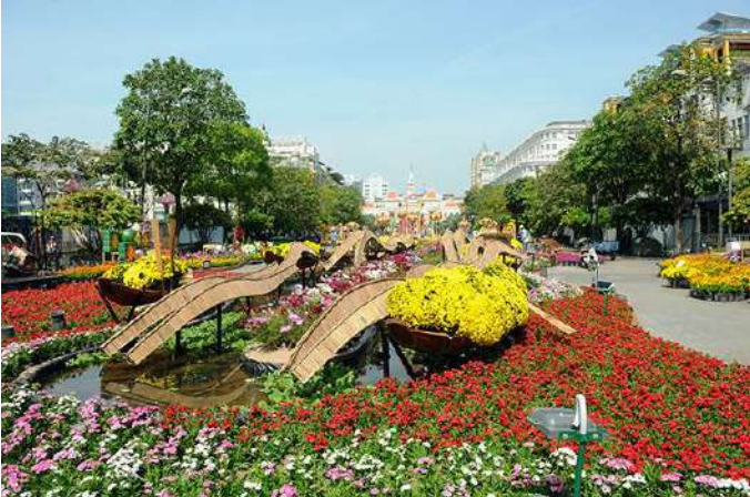
Flower Display on Nguyen Hue Street in Ho Chi Minh City

Youth Cultural House: 9 Jan –29 Jan at 4 Pham Ngoc Thach – Dist. 1. Popular with locals especially on special occasions/holidays.