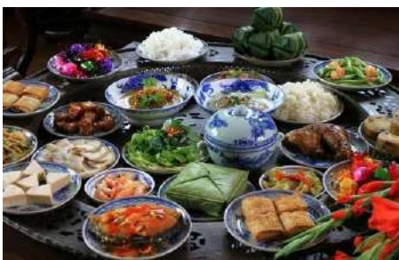
A typical meal offering to ancestors.

Vietnamese families traditionally lay out a tray of 5 fruits at the altar called “Mâm Ngũ Quả”. The fruits are colorful and meaningful. Asian mythology, the world is made of five basic elements: metal, wood, water, fire and earth. The plate of fruits on the family altar at New Year is one of the several ways to represent this concept. It also represents the desire for good crops and prosperity.