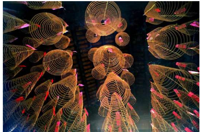
Burning incense in Chinese Temple District 5 (a piece of paper is attached to the incense, prayer writes name of the deceased or those who they are praying for).

Continental, Kim Đô, Oscar, and Bông Sen, Palace Music, etc..) throughout February