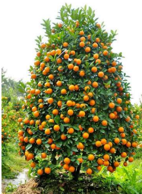
Cây Quất (Kumquat Tree)

Like a "family tree", the Kumquat plant symbolically represents the many generations of a household. The fruits are grandparents, the flowers are parents and the buds and green leaves are children. Kumquat plants are carefully selected for their symmetrical leaves, color and shape of fruit.