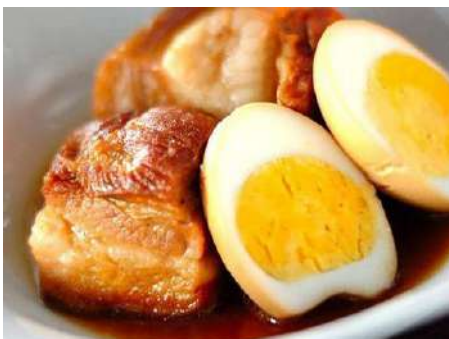
Thịt Kho Tàu (meat stewed in coconut juice)