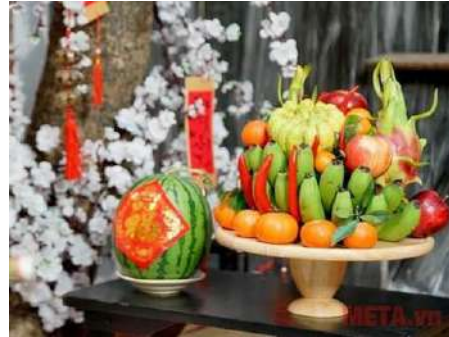
Fruit offering in the North include kumquats, bananas, oranges and Buddha hands.

Vietnamese families traditionally lay out a tray of 5 fruits at the altar called “Mâm Ngũ Quả”. The fruits are colorful and meaningful. Asian mythology, the world is made of five basic elements: metal, wood, water, fire and earth. The plate of fruits on the family altar at New Year is one of the several ways to represent this concept. It also represents the desire for good crops and prosperity.