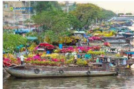
Ben Binh Dong Flower Market (open from 20 th of lunar December)

Similar to the pine tree for Christmas holiday in the West, Vietnamese also use many kinds of flowers and plants to decorate their