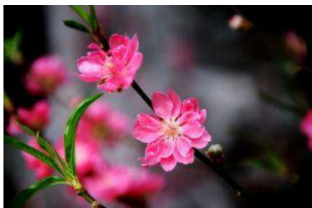
Hoa Đào (Peach Blossom)

Hoa Đào (peach blossom) is more common in the North as it can grow in the dry and cold weather. It is used to ward off evil spirits during the Tết celebrations.