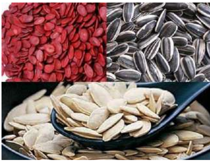
Hạt Dừa, Hạt Bì, Hạt Hướng Dương (roasted seeds).