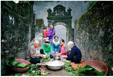
Preparing Bánh Chung for Tet