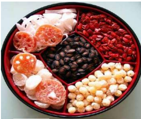
Mứt (dried fruit)