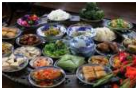
A typical meal offering to ancestors. Vietnamese families traditionally lay out a tray of 5 fruits at the altar called “Mâm Ngũ Quả”. The fruits are colorful and meaningful. Asian mythology, the world is made of five basic elements: metal, wood, water, fire and earth. The plate of fruits on the family altar at New Year is one of the several ways to represent this concept. It also represents the desire for good crops and prosperity.