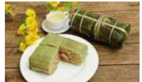
Bánh Chưng and Bánh Tét

Thịt Kho Tàu : "Meat Stewed in Coconut Juice", a traditional dish of pork belly and medium boiled eggs stewed overnight in a broth-like sauce, often eaten with pickled bean sprouts and chives and white rice.