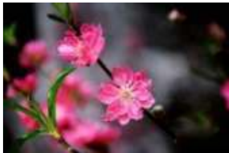
Hoa Đào (Peach Blossom)

Hoa Đào (peach blossom) is more common in the North as it can grow in the dry and cold weather. It is used to ward off evil spirits during the Tết celebrations.