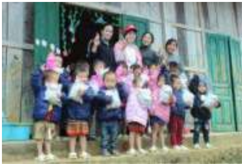
Santa Fe in the Community