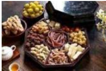
Mứt (dried fruit)