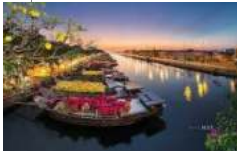
Ben Binh Dong Flower Market (open from 20 th of lunar December)

Similar to the pine tree for Christmas holiday in the West, Vietnamese also use many kinds of flowers and plants to decorate their homes for the holiday. Traditional plants include the Hoa Đào (Peach Blossom), Hoa Mai (Ochna Integerrima) and Cây Quất (Kumquat Tree). These plants represent coziness and prosperity. Other flowers may be displayed too.