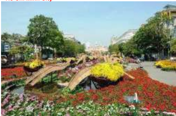
Flower Display on Nguyen Hue Street in Ho Chi Minh City

Youth Cultural House 27Jan to 16 Feb at 4 Pham Ngoc Thach – Dist. 1. Popular with locals especially on special occasions/holidays.