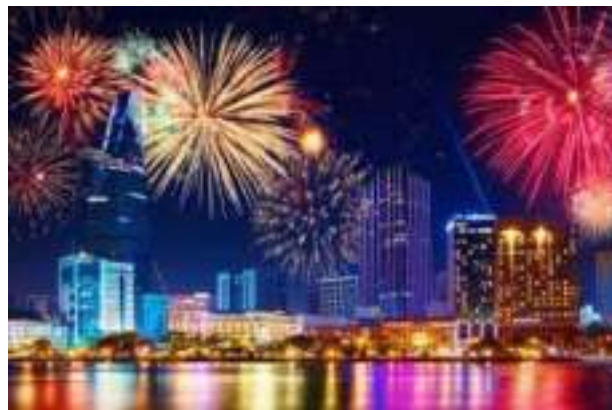
Firework on New Year Eve in Dist. 1

Due to Covid-19 situation, Ho Chi Minh have canceled fireworks this year