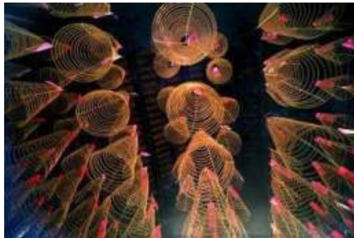
Burning incense in Chinese Temple District 5 (a piece of paper is attached to the incense; prayer writes name of the deceased or those who they are praying for).

Annual Flower Street: displays will be up from 7pm, 09 Feb and from 08am to 5pm every day till 15 Feb on Nguyen Hue Street. . This year the flower decoration will be a combination of organic design and architecture with 26 buffalo design through 720m flower street