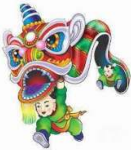
Events & Activities (Hanoi & Ho Chi Minh) Calendar of Events, Business Hours