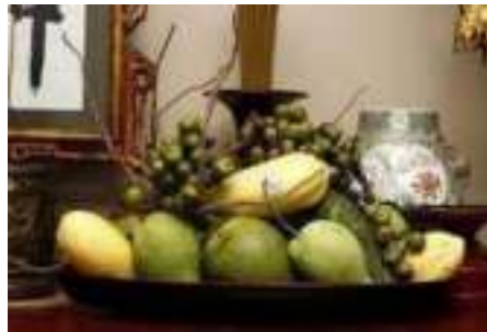
Fruit offering in the South include custard apples, coconuts, papayas, mango and goolar fig. In Vietnamese they are “Cầu ,Dừa, Đủ , Xoài, Sung” which in the South literally is a prayer to “have enough to use” in the New Year.