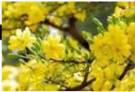
Hoa Mai (Ochna Integerrima)

The spectacular yellow flowers of the Hoa Mai ( Ochna integerrima ) make it very popular in southern Vietnam.