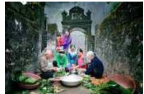
Preparing Bánh Chưng for Tet