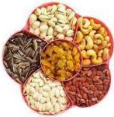
Hạt Dừa, Hạt Bí, Hạt Hướng Dương hạt điều, nho khô(roasted seeds).