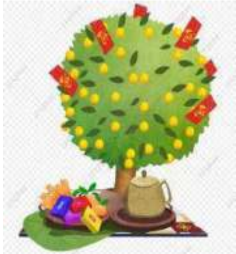
Cây Quất (Kumquat Tree)