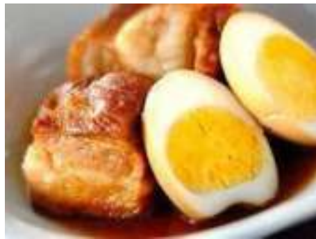
Thịt Kho Tàu (meat stewed in coconut juice)