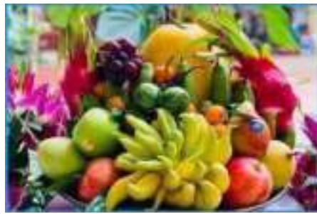
Fruit offering in the North include kumquats, bananas, oranges and Buddha hands.