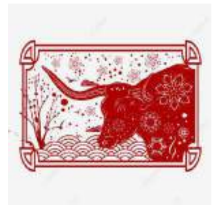
Year of The Ox - 2021