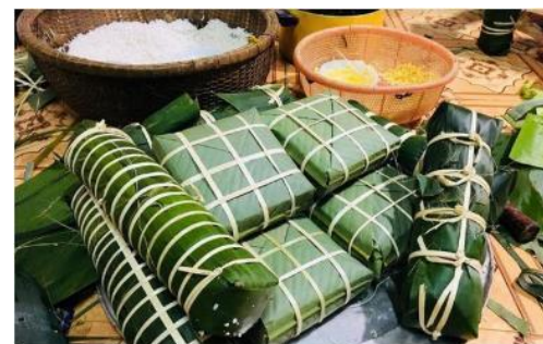
Bánh Chưng and Bánh Tét

Thịt Kho Tàu : "Meat Stewed in Coconut Juice", a traditional dish of pork belly and medium boiled eggs stewed overnight in a broth-like sauce, often eaten with pickled bean sprouts and chives and white rice.