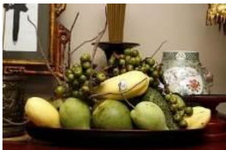
Fruit offering in the South include custard apples, coconuts, papayas, mango and goolar fig. In Vietnamese they are “Cầu, Dừa, Đủ, Xoài, Sung” which in the South literally is a prayer to “have enough to use” in the New Year.