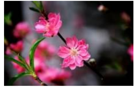
Hoa Đào (Peach Blossom)

Hoa Đào is more common in the North as it can grow in dry and cold weather.