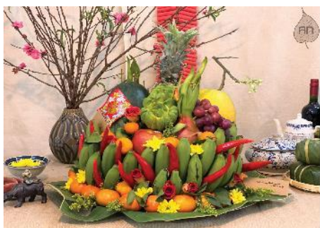
Fruit offering in the North include kumquats, bananas, oranges and Buddha hands.

Vietnamese families traditionally lay out a tray of 5 fruits at the altar called “Mâm Ngũ Quả”. The fruits are colorful and meaningful. Asian mythology, the world is made of five basic elements: metal, wood, water, fire and earth. The plate of fruits on the family altar at New Year is one of the several ways to represent this concept. It also represents the desire for good crops and prosperity.