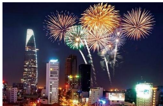
Firework on New Year Eve in Dist. 1