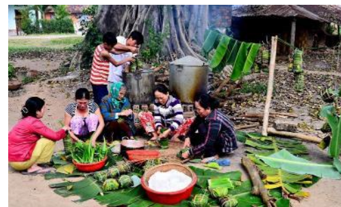
Preparing Bánh Chưng for Tet