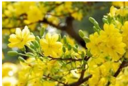
Hoa Mai (Ochna Intergerrima)

Live, blooming flowers symbolize the rebirth that will take place in the coming spring and fruit blossoms symbolize the start of the cycle that will result in a new crop of fruit later in the year. These two distinct flowers are widely sold and purchased during Tết. The spectacular yellow flowers of the Hoa Mai is popular in southern Vietnam.