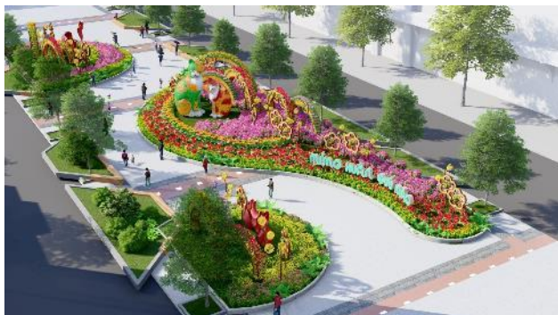
Flower Display on Nguyen Hue Street in Ho Chi Minh City

Youth Cultural House 06 Jan to 26 Jan at 4 Pham Ngoc Thach – Dist. 1. Popular with locals especially on special occasions/holidays.