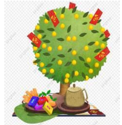
Cây Quất (Kumquat Tree)

Like a "family tree", the Kumquat plant symbolizes the many generations of a household.