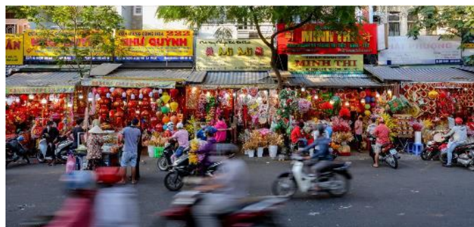
Home Decorative Items Area in China Town, District 5

This year is the celebration for 20 years of Flower Street, beside the Cat (mascot of year 2023), there will be image of the previous 20 mascots.