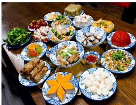
A typical meal offering to ancestors.

Vietnamese families traditionally lay out a tray of 5 fruits at the altar called “Mâm Ngũ Quả”. The fruits are colorful and meaningful. Asian mythology, the world is made of five basic elements: metal, wood, water, fire and earth. The plate of fruits on the family altar at New Year is one of the several ways to represent this concept. It also represents the desire for good crops and prosperity.