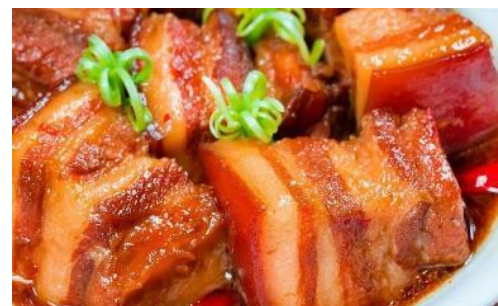
Thịt Kho Tàu (meat stewed in coconut juice)