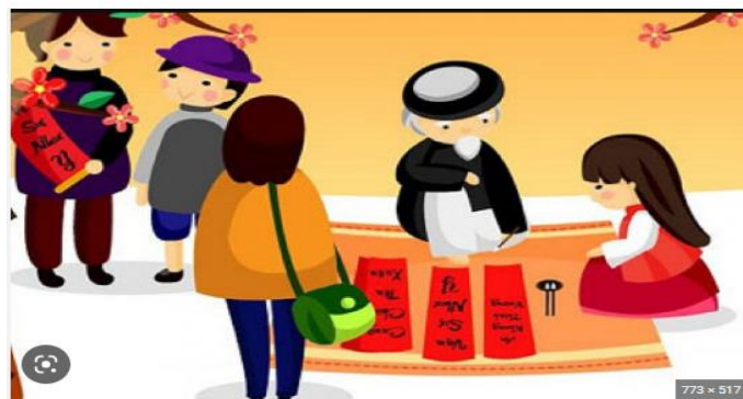
Ông Đồ (Calligraphy Artist)

Kitchen God broadcast on 20:10 21 January 2023