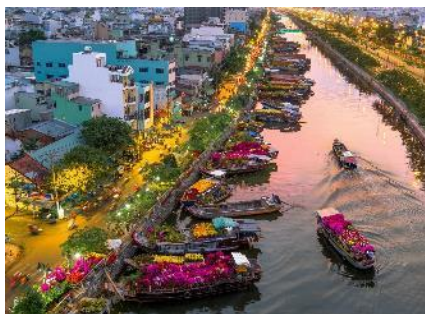
Ben Binh Dong Flower Market (open from 14 th January 2023)

Like the pine tree for Christmas holiday in the West, Vietnamese also use many kinds of flowers and plants to decorate their homes for the holiday. Traditional plants include the Hoà Đào (Peach Blossom), Hoà Mai (Ochna Integerrima) and Cây Quất (Kumquat Tree). These plants represent coziness and prosperity. Other flowers may be displayed too.